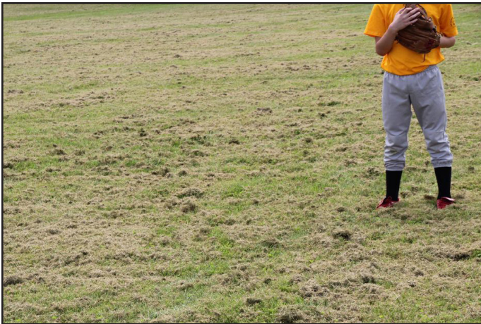
Excessive Grass Clippings