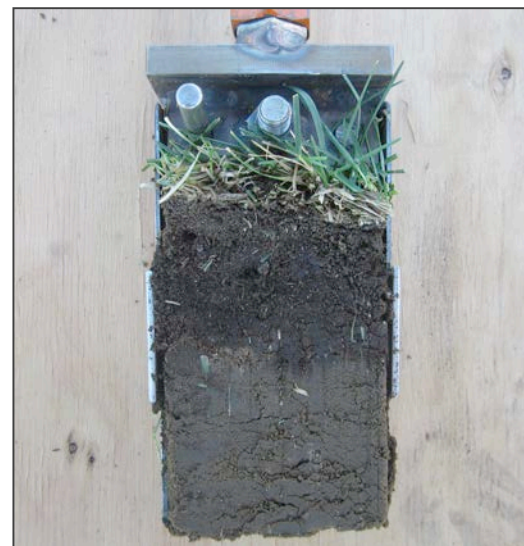
Figure 8. Compost topdressing is extremely difficult to incorporate into the existing soil. Topdressing should coincide with aggressive hollow-tine cultivation to mix the compost as much as possible with the existing soil. However, a topdressing layer is still likely to form, as seen above.

Fields constructed with native soils will have greater moisture holding capacity if soil organic matter (SOM) content is 4-6%. If the SOM is <4%, and the soil test P value is less than 20 lbs/acre modified Morgan extractable P, consider compost applications to increase SOM levels into the 4-6% range. Use a compost low in P (<0.3% P 2 O 5 ), and test soil for P 1-3 months after every compost application. Amounts of phosphate applied for various depths of application and concentrations of phosphate in compost are listed in (Table 3). If the field is a sand-based constructed field, increasing SOM content greater than about 1% is not recommended.