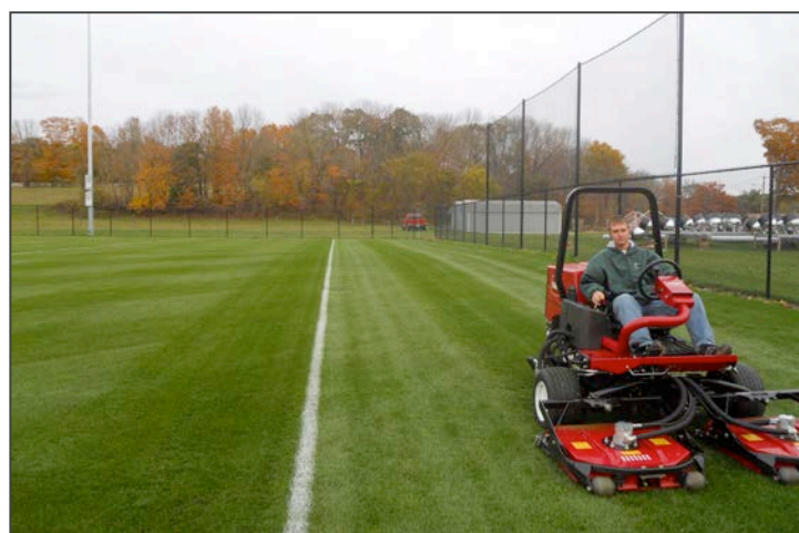
Figure 1. Consider using rotary mowers with contour decks. These mowers are easier to maintain than reel mowers, provide a high quality cut, disperse clippings very well and stripe nicely.

Mow when turfgrass is dry to maximize clipping dispersion and sharpen blades often.