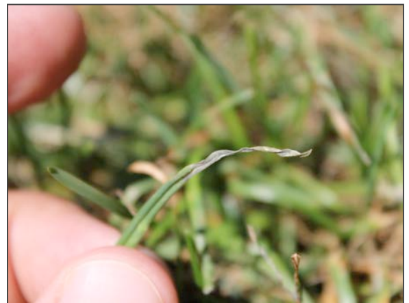
Figure 6. Gray leaf spot can be a devastating disease for perennial ryegrass. Selecting disease resistant cultivars is critical.