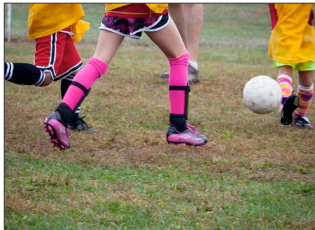
Figure 4. Weeds do not have the same traffic tolerance as turfgrasses. Therefore, percent cover can be reduced dramatically when fields are heavily used, decreasing traction and increasing surface hardness. This is particularly a concern when crabgrass begins to go dormant in the fall, as seen above.

Corn gluten meal (CGM), an organic, pre-emergent herbicide noted to exhibit root-inhibiting properties that also has a nitrogen component (usually 9-10%), has been shown to significantly reduce crabgrass germination when applied at the recommended rate (20-25 lbs/1000 ft 2 ) (Christians, 1993). However, crabgrass suppression was not effective in other research (Miller and Henderson, 2012, St. John and DeMuro, 2013). CGM has herbicidal activity, preventing root formation of some germinating plants. Therefore, efficacy can be enhanced when CGM-affected weeds are subjected to a period of water stress.