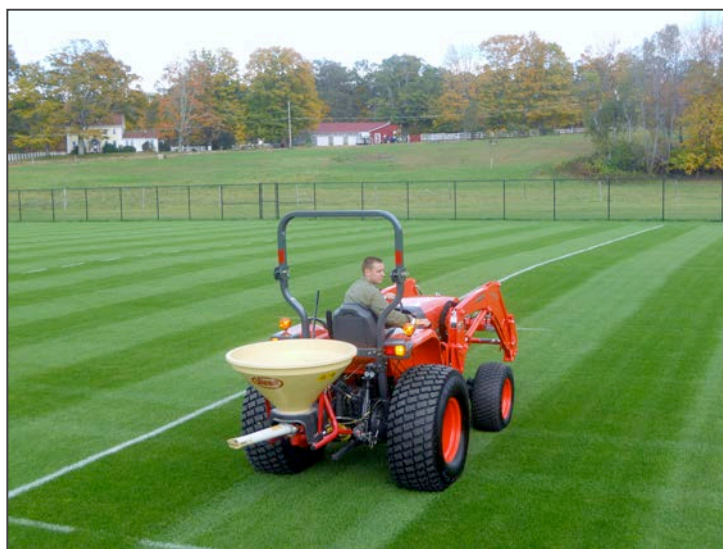
Figure 2. Consider using high capacity broadcast spreaders to cover large areas quickly.

Soil test every 1-3 years to monitor soil nutrient levels and pH. Follow soil test recommendations for P and potassium (K). Maintain P levels at the low end of the optimal range to discourage annual bluegrass encroachment. The optimum range for P is 6-20 lbs per acre (modified Morgan). Results from other laboratories may vary due to the method used to measure soil available P. It is advisable to use the university laboratory in your state to eliminate confusion.