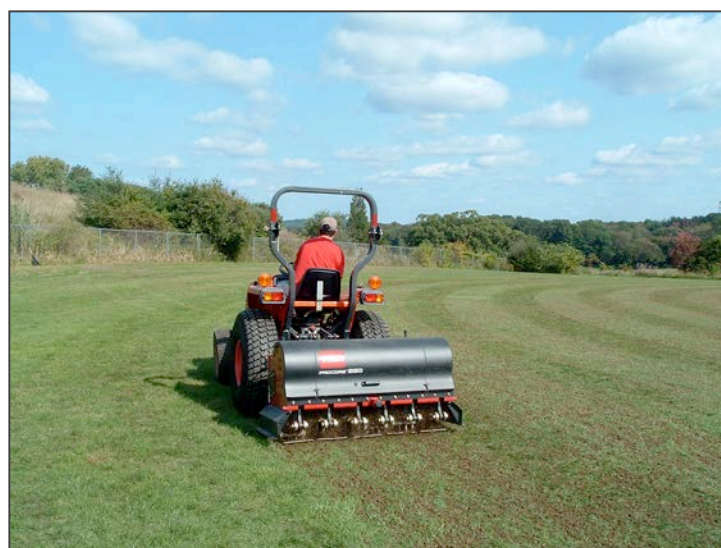
Figure 3. Use only Power Take-Off (PTO) driven, vertically-operating, core cultivation units. These units can provide consistent penetration depth to 3-4". Avoid drum-type core cultivators whenever possible due to their shallow, inconsistent penetration depth.

STC is preferred at this time of year due to less surface disruption than HTC with anticipated heavy fall field usage. STC creates some voids at the surface for gas exchange and water movement, and will also provide some mechanical control for white grubs (McGraw and Holdrege, 2012). Generally in the fall, white grubs are actively feeding (located in the 3-4" soil depth range) from August 1 through November (Figure 5). Therefore, the opportunity to inflict damage to the grubs also spans this range. Further delaying cultivation extends the active feeding period and negatively impacts turfgrass recovery as growth slows with reduced temperatures.