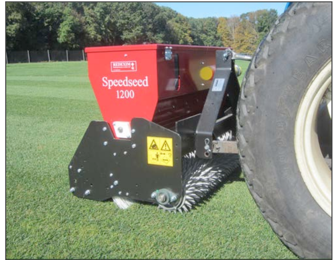
Figure 7. In the absence of imminent cleated traffic, seed should be applied using a spike seeder that will maximize seed to soil contact while minimizing damage to the existing turfgrass stand.

Seed should be broadcast immediately prior to a cleated practice or game allowing players to work seed into the soil and optimize seed to soil contact. If traffic is not imminent, seed should be applied using a spike seeder that will maximize seed to soil contact while minimizing damage to the existing turfgrass stand (Figure 7). If the athletic field is used May-August, apply 3-5 lbs of PR seed/1000ft 2 per month.